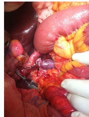
Figure 1: Dissection of the hepatic hilum, pyloric and gastro duodenal vessels, lymphadenectomy of the celiac trunk, Kocher maneuver and interaortocaval lymphadenectomy.

Fukuda [1], noted that the pancreaticoduodenectomy with resection of the portal vein may be only potential cure for patients with pancreatic duct adenocarcinoma and involvement of the portal vein. In our case, the portal vein was repaired with a pericardial patch. We present this case to show thrombosis as complication after intraoperative use of pericardial patch to close the defect secondary to vascular invasion by the tumor.