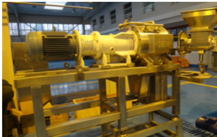
Figure 1: Separation pre-pressing equipment made by the ministry of agriculture of modern apple industry technology system (depending on the Shaanxi Normal University) and Xi'an Ding He machinery manufacturing.