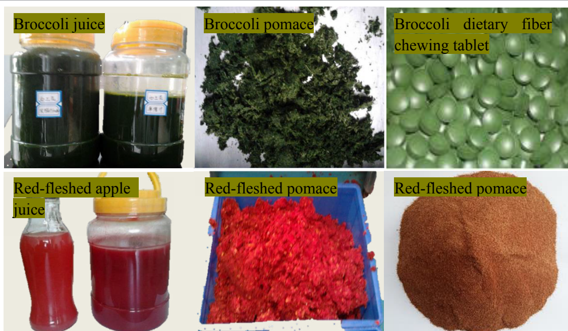
Figure 4: Broccoli, red-fleshed apple were processed by the separation pre-pressing technology.

fruit peel and especially fruit cuticular waxes as promising and highly available sources. Apple cuticular waxes are receiving more and more attention because of biologically active triterpenoids [44]. Mueller [45] confirmed that triterpenoids present in apple peel and \beta -damascone may be helpful in the treatment of IBD as nutrient supplements. Xiangjiu and Rui Hai [46] isolated triterpenoids from apple peels and confirmed that triterpenoids have potent in anti-proliferative activity and suggested that it may be partially related with the anticancer activities. Triterpenoids are being evaluated for use in new functional foods, drugs, cosmetics and healthcare products. Apple peel is expected to be developed to triterpenoid-containing products.