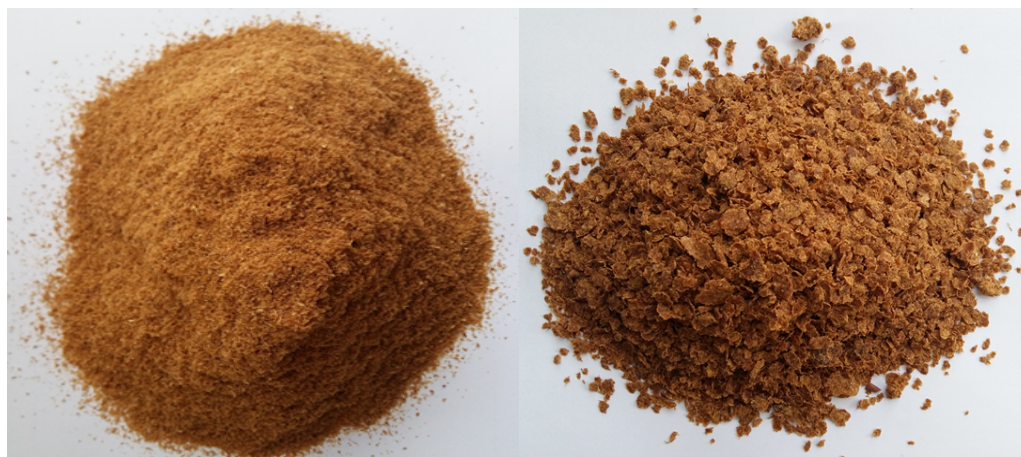
Figure 3: Apple flesh was dried by vacuum paddle drying method.