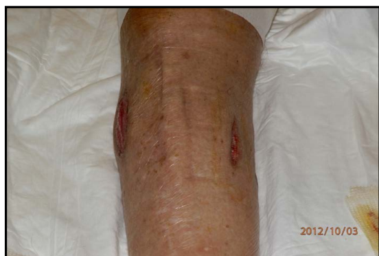
Figure 4: Fasciotomy outcome.

appropriate antibiotic therapy are very important before and after the revascularization procedure. Currently [8] guidelines recommend penicillin or cefazolin (or clindamycin for the \beta -lactam allergic patient) for prophylaxis for a period of up to 5 days (BII level of evidence). Based upon consensus opinion (BIII level of evidence), we recommend vancomycin, daptomycin or linezolid for empiric Gram-positive coverage. Ceftazidime, cefepime or meropenem are recommended for Gram-negative infections, especially in settings of prolonged hospitalizations, with a duration of treatment for 7–14 days (BIII)