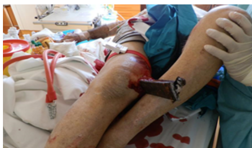
Figure 1: Penetrating trauma of thigh.

Trauma has emerged as a major public health problem in developing as well as developed countries, and vascular trauma is an important component of this problem. Penetrating injury is considered the most frequent, 82-94% in peripheral arteries injuries [1-3]; studies show that 73% limbs are salvaged while 27% sustain either primary or secondary amputation [4]. Femoral vessel injuries are among the most common vascular injuries treated in urban trauma centers, and may amount to 70% of all peripheral vascular injuries in some cases [5]. In this highly selected trauma population an incidence of about 10% of devastating outcomes has been demonstrated, with a mortality rate of 2.8% and an amputation rate of 6.5% [6]. Primary repair by direct sutures is used