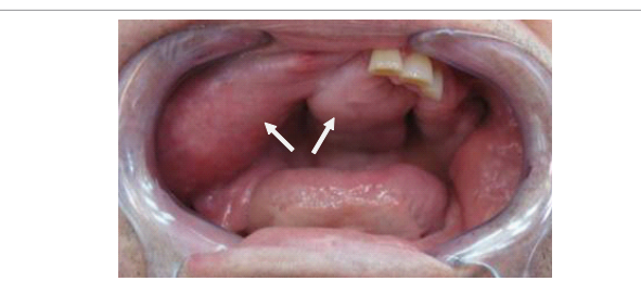
Figure 2: Unsatisfactory clinical conditions in the upper jaw, buccal soft tissue masses of the right side of the cheek.

Impression copings were placed on implants to achieve precise transfer of the intraoral location of the implants (position in situ ) to the similar position on the laboratory cast. Heavier body impression material was used and impression was sent to dental laboratory.