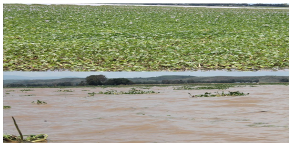
Figure 2: Dense mat and new invasion of hyacinth on Dembya and Gumara.