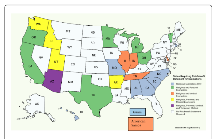
Figure 2: States requiring risk/benefit statement for each type of exemption form.