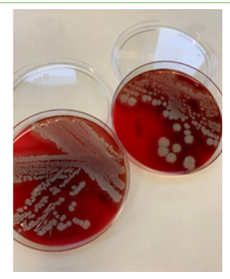
Figure 1: The selective media test: Columbia CNA Agar with 5% Sheep blood. Staphylococcus aureus isolated from the vials.

in diameter within 24-36 hours in air at 34°C -37°C. Colonies are smooth, yellowish (gold-coloured) pigment on blood agar (Figure 1).