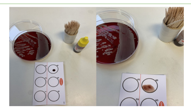
Figure 2: The coagulase testing, Staphylococcus aureus identification via appearance of flakes.

S. aureus is coagulase positive, i.e. is possible to identify flakes, because this reagent consists of sheep erythrocytes with fibrinogen (if staphylococci specific strain consists of this factor, is able to attach to that reagent and elicit the flakes) (Figure 2).