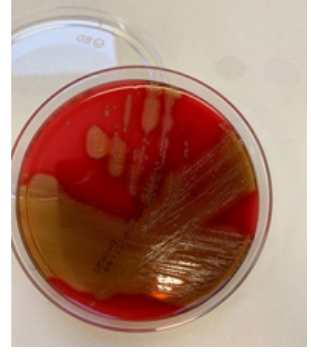
Figure 3: The selective media test: Columbia CNA Agar with 5% Sheep blood, Streptococcus pyogenes isolated from the vials.

The culture from the vials carried using selective media (Columbia CNA Agar with 5% Sheep blood) showed the growth of Streptococcus pyogenes (Figure 3). Colonies are surrounded by a zone of beta-hemolysis (the complete disruption of erythrocytes and the release of hemoglobin) (Figure 3).