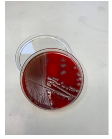
Figure 5: The selective media test: Columbia CNA Agar with 5% Sheep blood, Escherichia coli isolated from the biomaterials.

The culture from the vials carried using Columbia CNA agar with 5% Sheep Blood selective media showed the growth of Escherichia coli . These colonies with straight, rod shape bacteria on blood agar (Figures 5 and 6) [6-10].