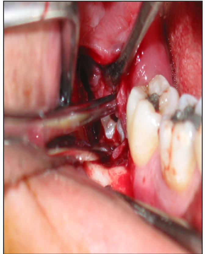
Figure 4. Intra-operative picture shows the retrieval of the displaced lower third molar from the lingual side of the mandible.

Articaine HCL was administered locally into surgical area (Ultracaine® DS Fort, Aventis Pharma, Turkey, 1:100,000 epi.). Incision for displaced tooth was made distal to the second molar and continued up to ascending ramus. An oblique release incision from the second molar's distal end into vestibular sulcus was also made. Buccal and lingual mucoperiosteal flaps were raised in the retromolar area. The pterygomandibular space was reached through lingual aspect and the tooth was visualized and removed ( Figure 4 ). The surgical site copiously irrigated and granulation tissue removed. The surgical site was closed with 3/0 Vicryl (Ethicon®, Johnson & Johnson Int., Brussels, Belgium). At the post-operative examination 10 days later, healing was uneventful and there were no evidences of any infection or trismus.