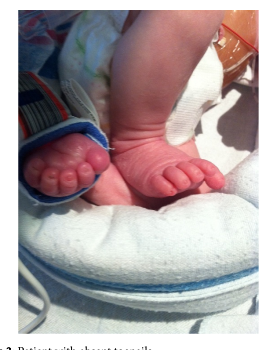
Figure 3: Patient with absent toenails

The presence of two different antiepileptic therapies was also unique to this case. Lamotrigine is considered one of the safest antiepileptic drugs for use during pregnancy, however the role of polytherapy in this association cannot be ruled out [16]. The International lamotrigine pregnancy registry published in 2007 identified 2 cases of HLH in pregnant women exposed to lamotrigine monotherapy [17].