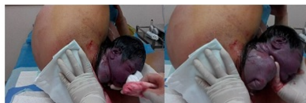
Figure 3: Shoulder emerged from perineum.

22% (20/92) babies cried before the shoulder were completely delivered, among them 10 babies cried before shoulder delivery, 10 cases during the delivery to chest, 62% (57/92) cried after birth, 16% did not cry after birth, but with normal skin color and normal breathe and heartbeat. All babies had normal Patten of live signs and no baby had sent to NICU (Figure 4).