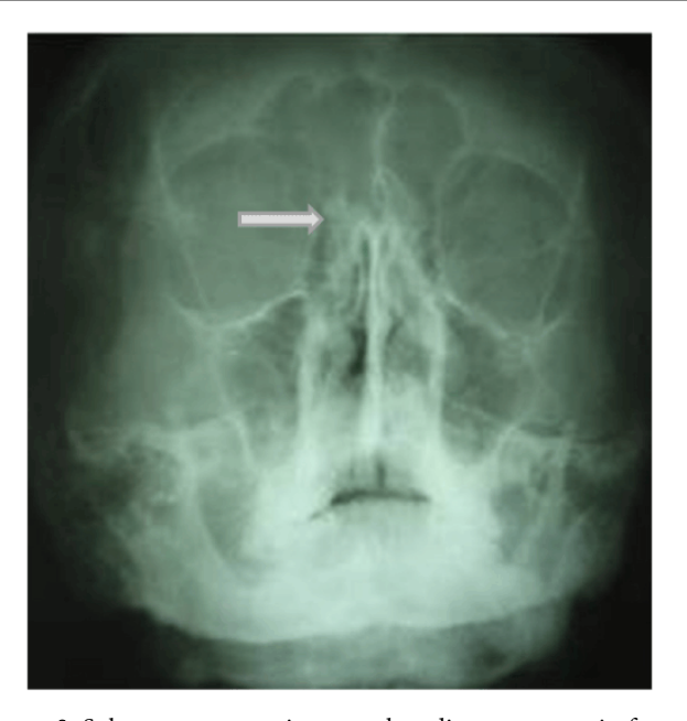
Figure 3: Submento-vertex view reveals radiopaque mass in frontal

With the above clinical, radiological and colonoscopy report we arrived at diagnosis of Gardner's Syndrome. As the facial swellings were benign and non-interfering with the function, patient was not willing for the surgical intervention for the Osteomas of mandible. Patient underwent prophylactic colectomy as the polyps have highest