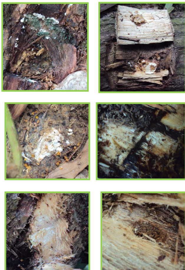
Figure 2: Photographs showing in vivo potentiality of Trichoderma and pathogenicity of Ganoderma spp.