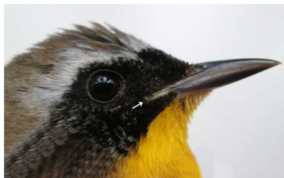
Figure 2: Common Yellowthroat, male, parasitized by a partially engorged Ixodes sp. nymph. Arrow points to engorged nymph.

At Ste-Anne-de-Belleville, Québec, a partially engorged I. affinis nymph (15-5A51) was collected from a Common Yellowthroat, Geothlypis trichas (Linnaeus), a southern temperate songbird, on 26 May 2015 (Figure 2). The nymph tested positive for B. burgdorferi s.l. and, based on DNA sequencing, was validated as B. burgdorferi s.s. The discovery of I. affinis nymphs in Québec constitutes a new extralimital distribution record for this tick species. As well, it is the first account of I. affinis on birds in Québec and, notably, the first report of a B. burgdorferi s.l.-infected I. affinis in Canada.