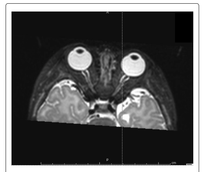
Figure 2: Axial MRI orbits demonstrating bilateral optic nerve hypoplasia. The optic nerves and optic chiasm appear to be smaller; the globes are intact.

neuroimaging has been useful in identifying asymptomatic or minimally symptomatic patients at much earlier age.