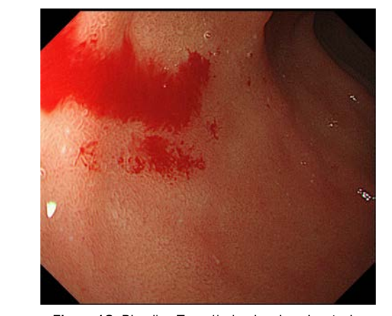
Figure 1C: Bleeding Type 1b duodenal angioectasia.

of Helsinki. Written informed consent was obtained from all patients prior to the procedures. The study was approved by the ethical committee of Sapporo Kosei Hospital.