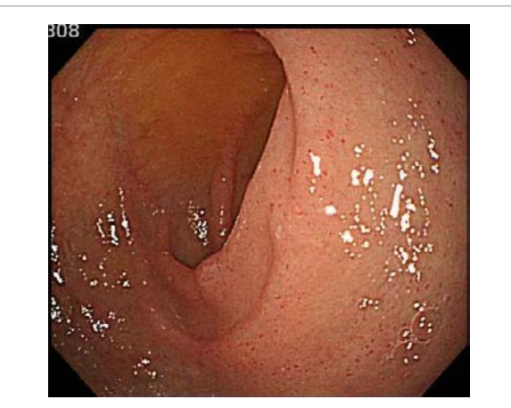
Figure 1A: Type 1a-punctulate erythema (<1 mm), with or without oozing.