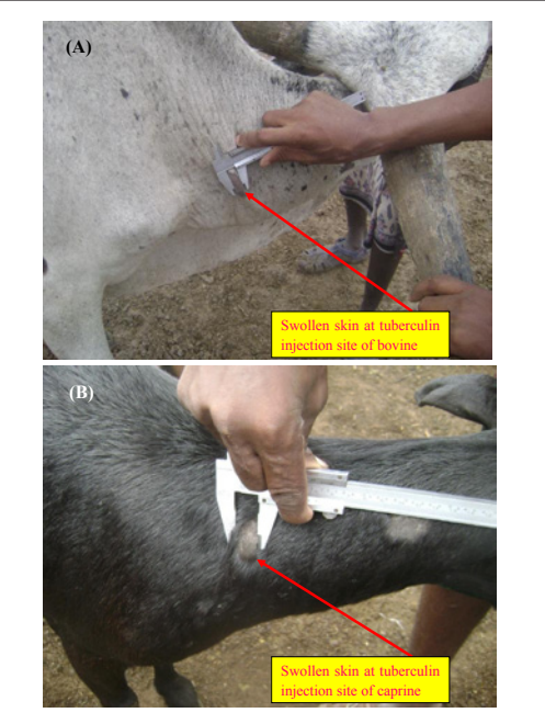
Figure 2: Swelling on the skin of bovine tuberculin reactor cow (A) and goat (B), after 72 hours of injection with bovine PPD.

individually identified by names, which were previously given by their owners or assigned on the day of tuberculin inoculation, using identification numbers temporarily written on their back. Their age, Body Condition Score (BCS), sex, lactating status, reproductive status, and skin test measurements were recorded on prepared format sheet. Body condition score of cattle was determined using the method of Nicholson and Butterworth [14], and age determination using the method of Dyce et al. [15]. For small ruminants, BCS was based on the Langston University method [16], and age determinations were based on ESGPIP method [17,18].