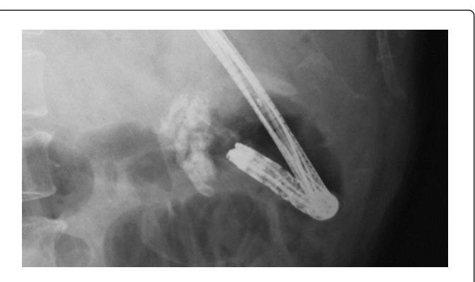
Figure 2b: Fluoroscopic findings of endoscopic obliterative therapy with N butyl-2-cyanoacrylate for anastomotic varices (case 2).

Endoscopic obliterative therapy with a high concentration of N-butyl-2-cyanoacrylate is useful for patients with anastomotic varices after choledochojejunostomy.