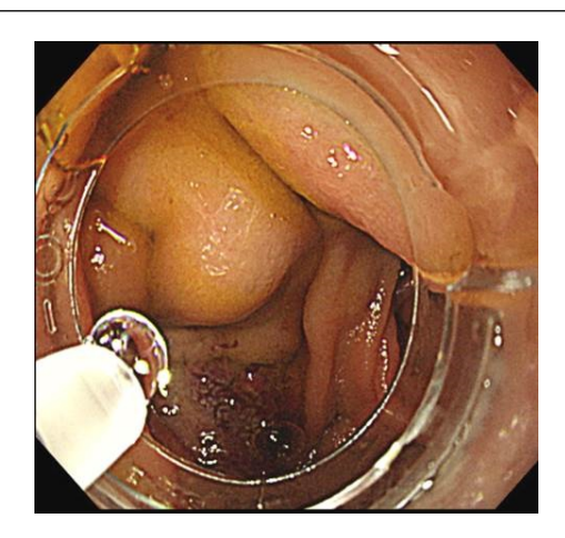
Figure 2a: Endoscopy revealed large, coil-shaped varices in the afferent jejunal loop(case 2).

For endoscopic obliterative therapy of anastomotic varices, we used N-butyl-2-cyanoacrylate diluted to a final concentration of 83% in 5% Lipiodol (Guerbert, Roissy, France). Lipiodol prevents the tissue adhesive from polymerizing too quickly and also allows for radiographic monitoring.