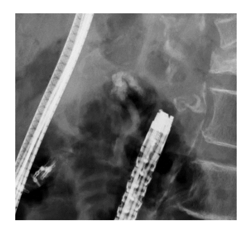
Figure 1b: Fluoroscopic observation with an infusion of n-butyl-2-cyanoacrylate to determine the extent of the varices (case 1).

Endoscopic obliterative therapy was successfully performed for two anastomotic variceal patients after choledochojejunostomy with a high concentration of N-butyl-2-cyanoacrylate (Histoacryl [2], B.Braun Dexon GmbH Spangenberg, Germany) (Figures 1a-2b).