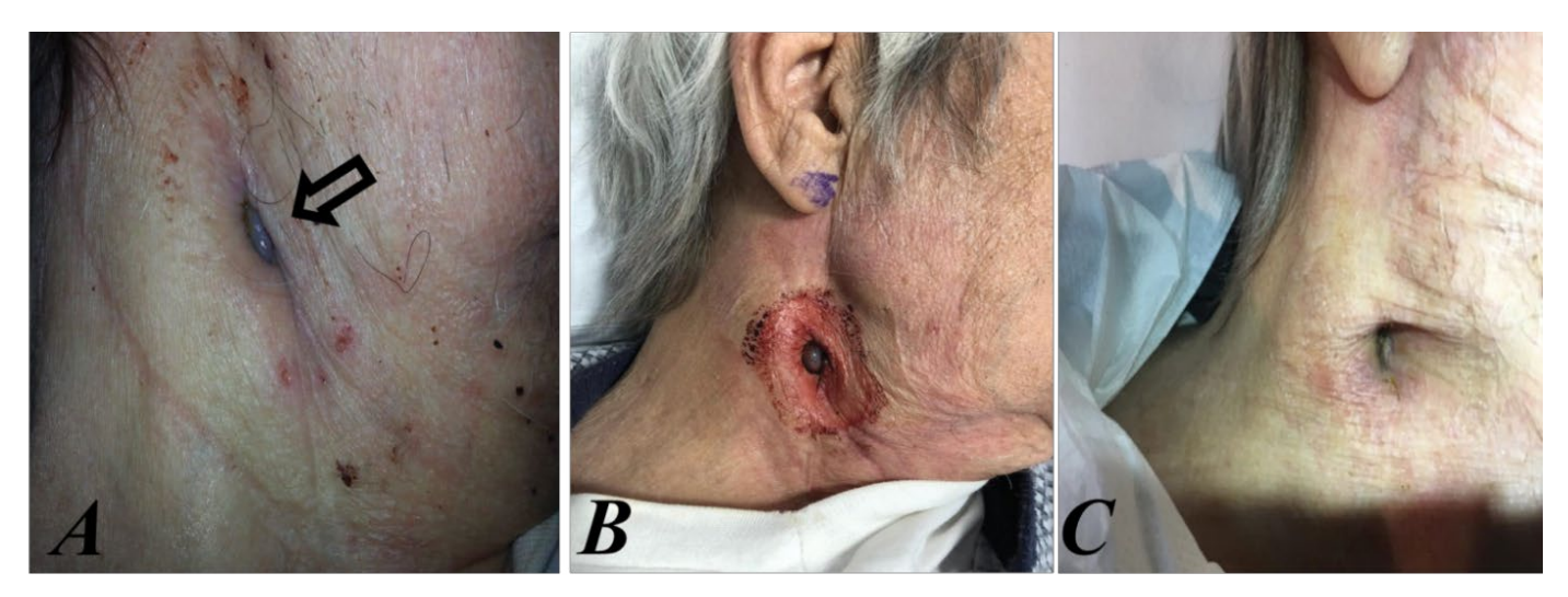
Figure 1: (A) Macroscopic aspect of the CCF (black arrow); B) preoperative image showing recent bleeding from the fistula; C) complete healing of the CCF four weeks postoperatively. CCF: Carotid-Cutaneous Fistula.

The majority of ICA-PAs is related to prior carotid endarterectomies; other possible but much less frequent causes of post carotid