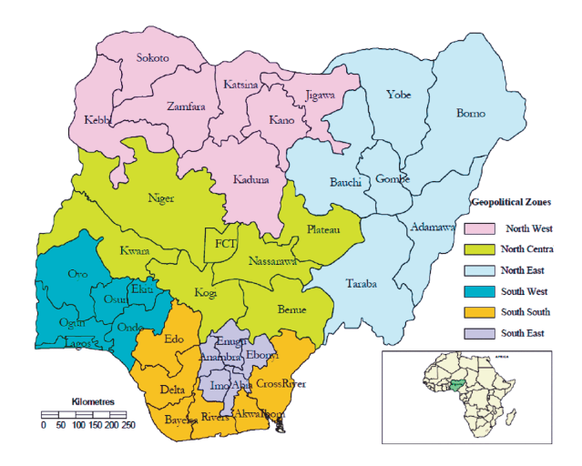
Figure 1: Map of Nigeria showing the geopolitical zones.

Study site. Nigeria is a federal republic comprising thirty-six states and one Federal Capital Territory (FCT) within which is the capital city of Abuja. The three largest and most influential ethnic groups in Nigeria are the Hausa in the Northern part, Igbo in South Eastern part and Yoruba in the South Western part of the country. The country is divided into six geo-political zones, which include South West, South South, South East, North West, North East, and North Central zones; see Figure 1. The study was carried out in Osun State, South West, Nigeria where the predominant culture is of the Yoruba ethnic group.