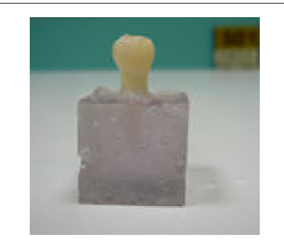
Figure 1: The representive graph of an embedded tooth

The designed experimental flow chart was as follows in Figure 2.