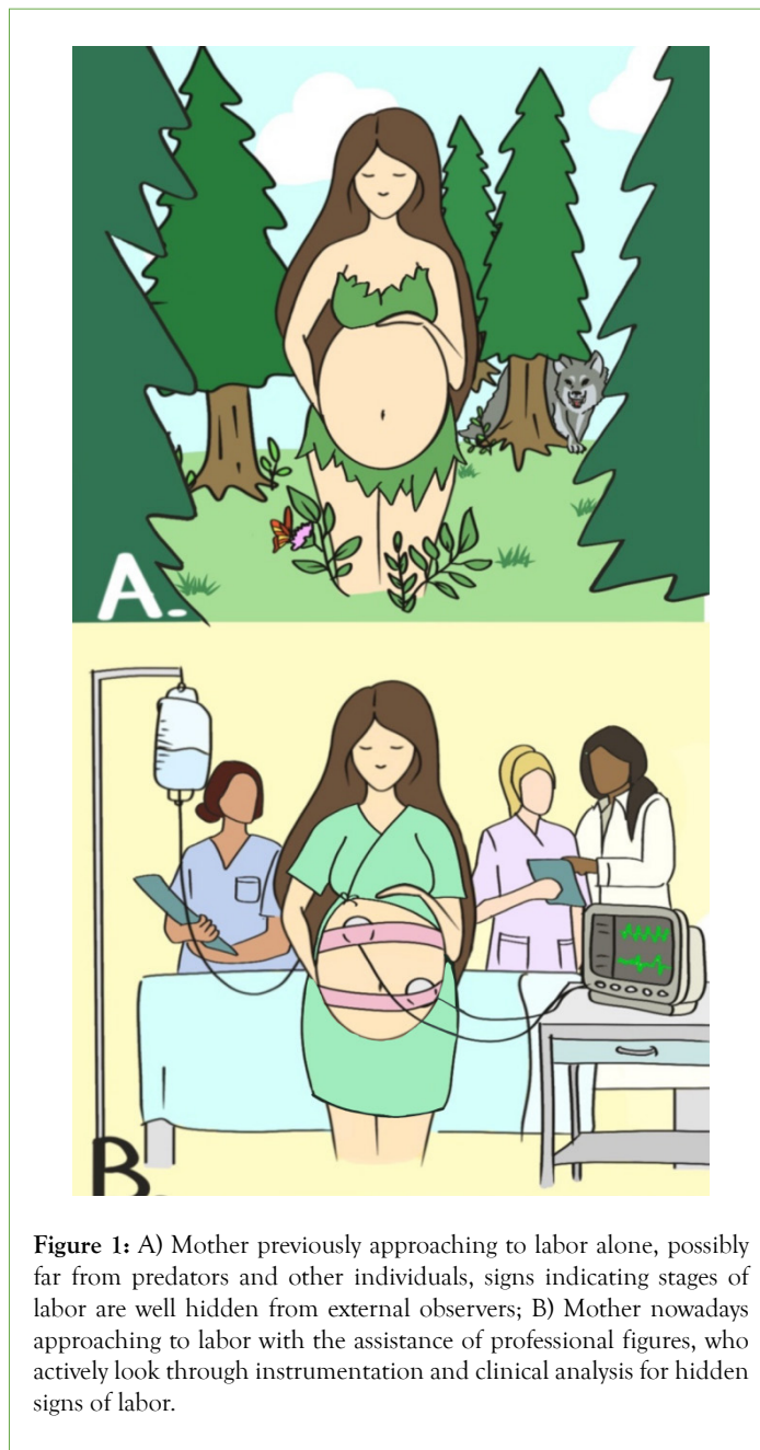
Figure 1: A) Mother previously approaching to labor alone, possibly far from predators and other individuals, signs indicating stages of labor are well hidden from external observers; B) Mother nowadays approaching to labor with the assistance of professional figures, who actively look through instrumentation and clinical analysis for hidden signs of labor.

Thus, while childbirth, by its nature, requires secrecy, nowadays we give birth involving many people (Figure 1). When did this start? When did women start asking for help? In other words, when was Obstetrics born?