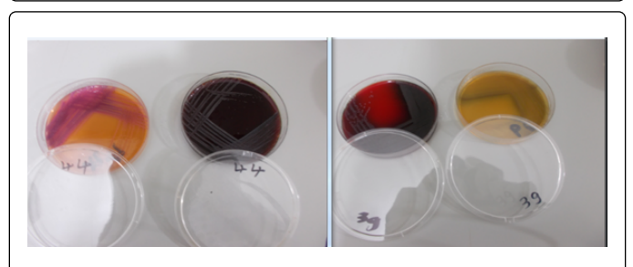
Figure 2: Pseudomonas species on blood and MacConkey agar plates showing different pigments.

Figure 1: Primary plating showing mixed growth.