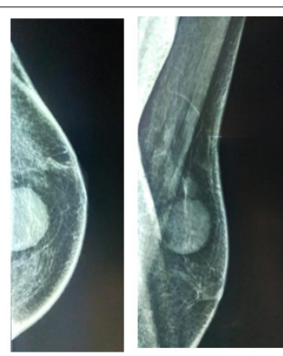
Figure 3: Imaging features of Dermatofibrosarfoma Protuberance Mammogram.

Ultrasound grayscale image shows a well-defined, oval, heteroechoic lesion, free from underlying muscles and overlying skin. Overlying skin is thickened.