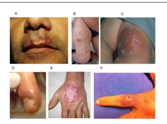
Figure 1: Example of some infections associated with anti-TNF alpha treatment: recurrent herpes infection (inset A), diffuse leg folliculitis (inset B), a gluteal boil (inset C), a whitlow case (inset D), a dermatophyte infection of the hand, misdiagnosed and treated with corticosteroid cream (inset E), the cutaneous leishmaniasis case.

decision to shift to Adalimumab was judged more prudential by the gastro-enterologist.