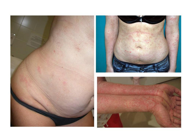
Figure 2: Some examples of the most severe eczematous dermatitis during anti-TNF alpha therapy.

Moderate to severe xerosis, with some exudative patches and itching lesions (Figure 2) appeared in 16 patients (23%), second in frequency only to infections, corresponding to literature datum of a 18% incidence rate [16]. No differences were noted in respect to the administered drug. In agreement with the literature the events are generally mild to moderate [15], not requiring biologic treatment modification, and responding to daily moisturizing with emollients and keratolytic agents in the majority of patients. Beside, all patients complained for itching, sometimes impairing night sleeping, and ameliorated by short curses of systemic antihistamine therapy. The most severe cases were also supported with local medium potency corticosteroids. A personal and /or familiar history of atopy has been suggested as the only factor predictive of eczematous complications during anti-TNF treatment [15], due to a certain Th1/Th2 imbalance, with a prevalence of Th2 activity, worsening clinical conditions just as atopic dermatitis [49]. The eczematous findings appear generally after the first month of therapy. None of our case reported previous atopic dermatits or a family history of atopy.