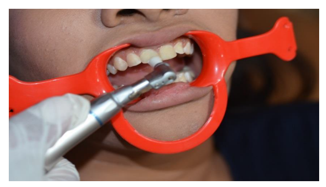
Figure 9: Polishing of restoration.