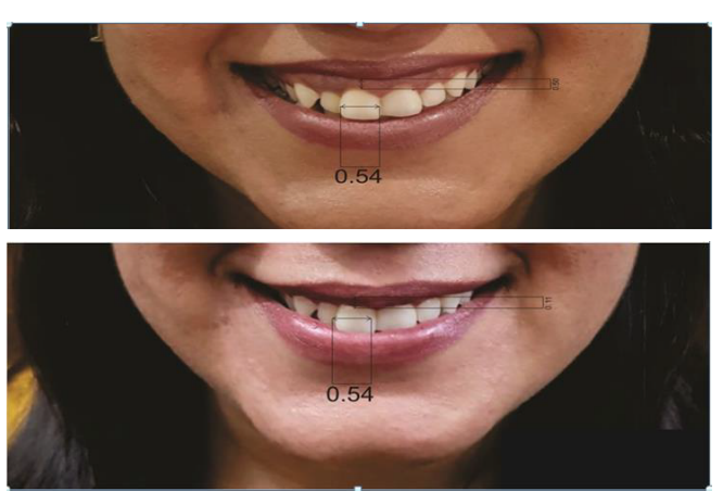
Figure 12: Patient with mixed gummy smile, before and after botulium toxin treatment.

at Sharda hospital SDS with chief complains of gums been visible when patient smile, on examination it was found approximately 3mm exposure of gum which brought patient slightly alarmed for her