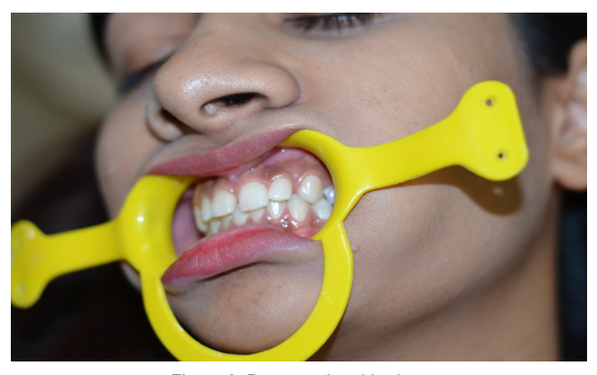
Figure 3: Pre-operative side view.