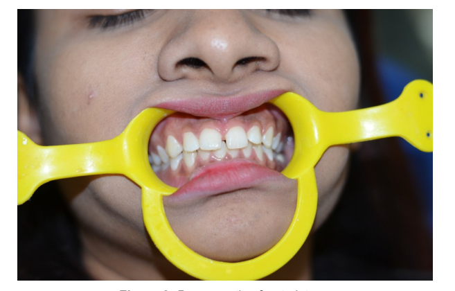
Figure 2: Pre-operative front picture.

To fabricate casts, impression were made using irreversible hydrocolloid material (Figures 5 and 6). A wax mock up was done corresponding to the patients facial and dental midline on cast. Patient was shown the mock up results and patient consent was taken for further treatment. Patient preparation was done and the area for the mock was scalled, isolate with rubber dam.