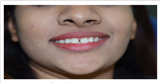
Figure 1: Preoperative picture.

A 23 old female reported at the Out Patient Department (OPD) of conservative and endodontics at Sharda hospital SDS having chief complain of space among maxillary anterior teeth (Figure 1). On examination uneven space between maxillary central incisor and between lateral incisor and canine on both right and left side was noted (Figures 2-4) the gap was approximately 1.5mm between central and lateral incisor and 2mm between central incisors [4].