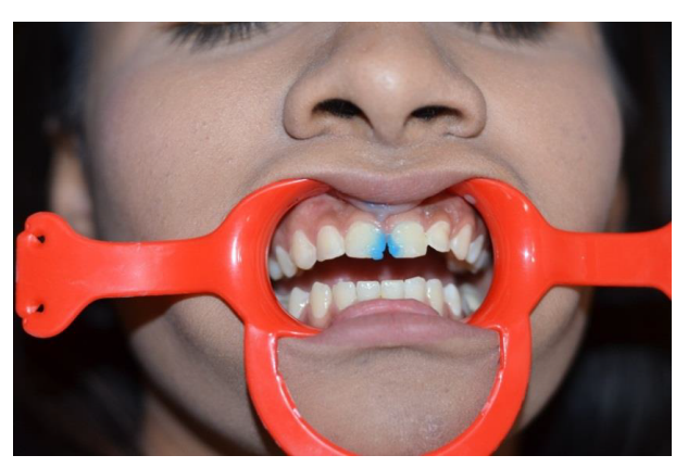
Figure 7: Shows use of etchant.