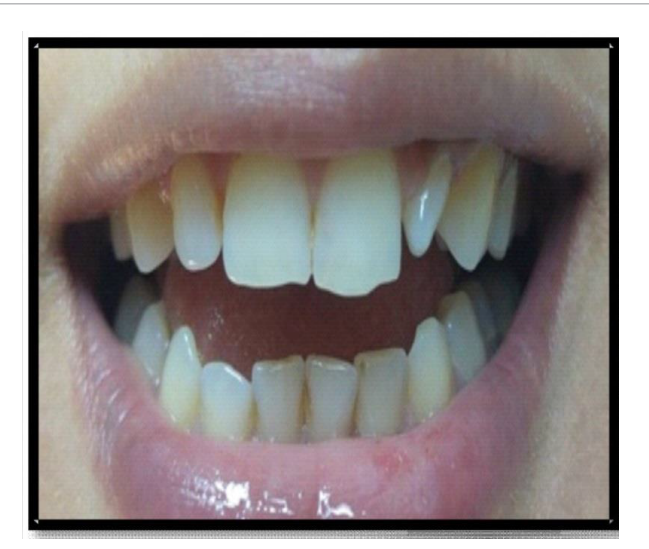
Figure 10: Shows peg lateral.