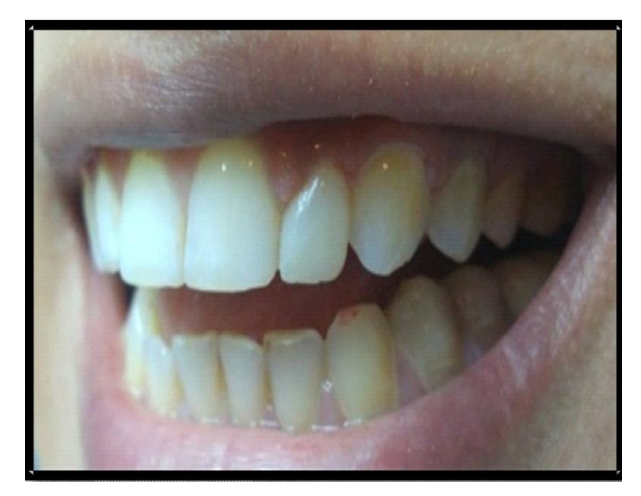
Figure 11: Finished restoration.

at Sharda hospital SDS with chief complains of gums been visible when patient smile, on examination it was found approximately 3mm exposure of gum which brought patient slightly alarmed for her