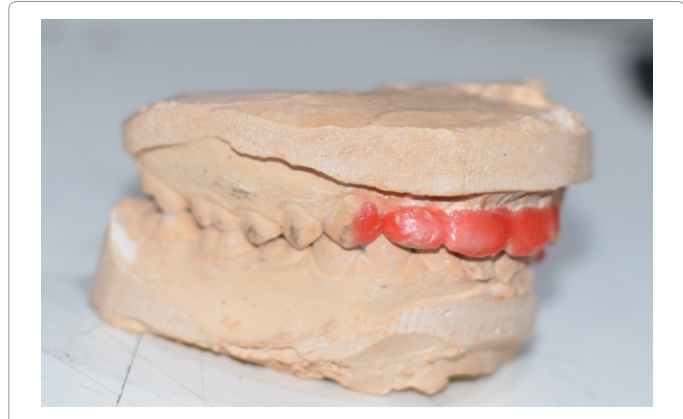
Figure 6: Diagnostic cast side view.

A 31 year old female reported at the Out Patient Department (OPD)