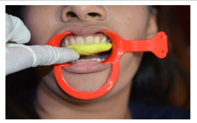
Figure 8: Try in of silicone putty index.