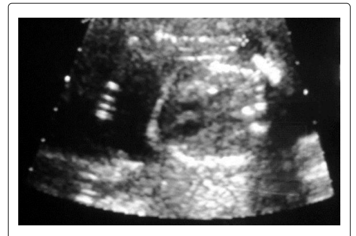
Figure 1: Echogenic cardiac focus, Accuson ultrasound image, from VCR tape, 1999.

anticoagulant (PTT-LA), dilute Russell viper venom test (DRVVT), lupus anticoagulant and homocysteine were all normal. A transthoracic echocardiogram was also normal. The most likely diagnosis is congenital rubella.