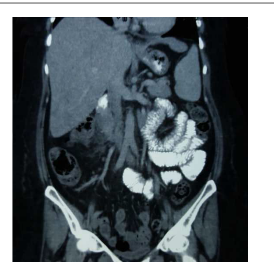
Figure 3: Computed tomography abdominal scan with oral and intravenous contrast: a large intra-abdominal, intraperitoneal, pus collection (abscess) that extending since the upper abdominal almost the pelvic cavity.

Figure 2: Computed tomography abdominal scan with oral and intravenous contrast of the one patient: large, relatively wellcircumscribed heterogeneous collection in the abdominal cavity surrounding the aorta and lymph nodes, some of them with heterogeneous enhancement.