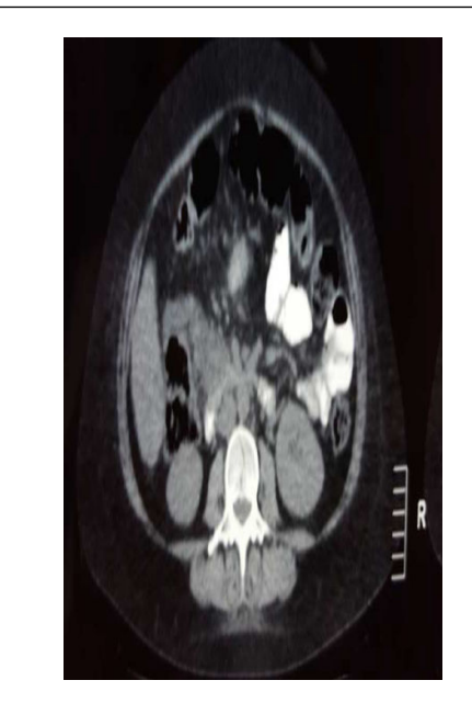
Figure 2: Computed tomography abdominal scan with oral and intravenous contrast of the one patient: large, relatively wellcircumscribed heterogeneous collection in the abdominal cavity surrounding the aorta and lymph nodes, some of them with heterogeneous enhancement.

Citation: Corti M, Maiolo E, Priarone M, Bruni G, Messina F, et al. (2016) Concomitant and Disseminated Infections due to Non-typhi Salmonella and Cryptococcus neoformans in AIDS Patients. Report of 2 Cases and Review of the Literature. Clin Microbiol 5: 252. doi: 10.4172/2327-5073.1000252