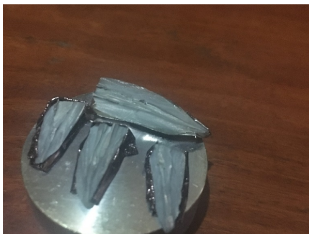
Figure 3. Specimen after sputtering and ready for scanning electron microscopy.