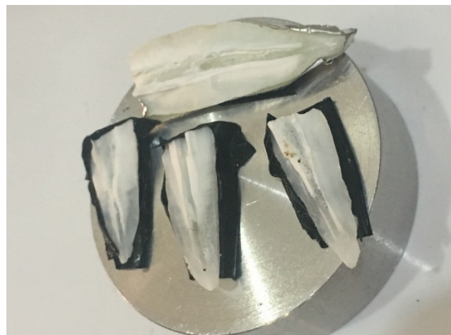
Figure 1. Split roots mounted on stub with double sided carbon tape.