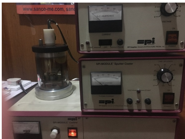
Figure 2. Mounted roots being sputtered with gold-palladium mixture.