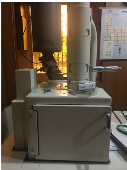
Figure 4. 30KV Scanning Electron Microscope JSM5910, JEOL, Japan.

SEM assessment was made by using Scanning Electron Microscope (JSM5910, JEOL, Japan) Figure 4 .