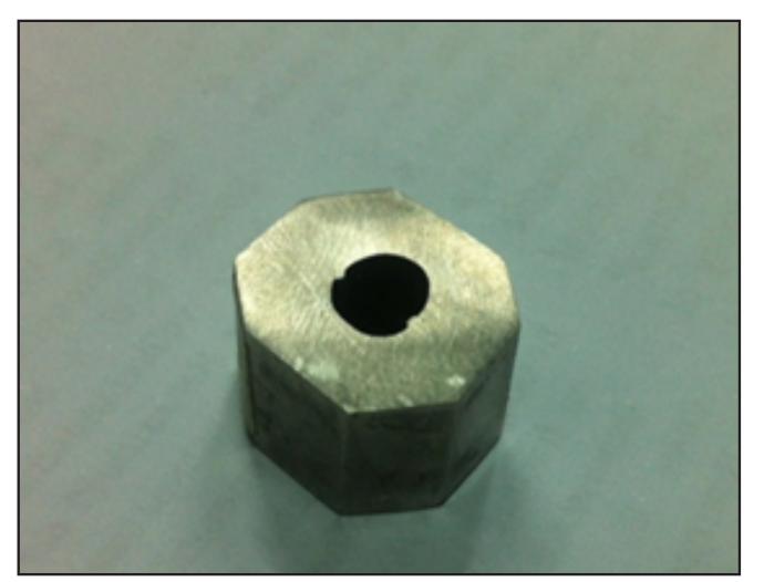
Figure 1: The octagonal metal base used to facilitate the measurement of the marginal gap in 8 pre-selected areas.

Data was analyzed using SPSS pc + version 21.0 statistical software. Descriptive statistics (mean, standard deviation, median and inter quartile range) were used to describe the quantitative symmetric and skewed study variable. Student's t -test for independent samples was used to compare the mean values between government (school) and private (nonschool) dental laboratories, and one-way analysis of variance was used to compare the mean values among the three labs. For non-parametric data, the statistical tests: Mann-Whitney U-test was used to compare mean ranks skewed data between government and private laboratories, whereas the Kruskal Wallis test was used to compare the mean ranks of skewed