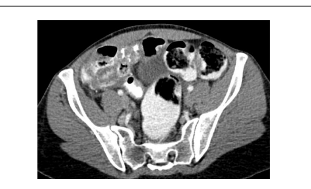
Figure 1: Image from the low-dose abdominal computed tomography scan showing inflammation of the caecum and terminal ileum.

Research of medical literature on human infection with Campylobacter jejuni or coli revealed a striking lack of data on this issue. Because our patient's Campylobacter coli isolate was resistant to both ceftriaxone and ciprofloxacin, she was treated 5 days with oral azithromycin for her bacteremia and discharged from the hospital.