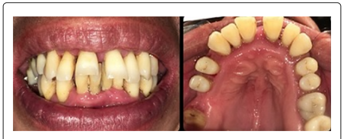
Figure 1: Intraoral photos.

trauma. He presented mobility grade III (Miller) of dental pieces 18; 17; 16; 15; 14; 24; 25; 27; 35; 34; 32; 31; 41; 42; 43; 44; 45. Grade II of the dental pieces 38; 13; 12; 11; 21; 22; 23 except teeth 3.3; and 3.2 that presented grade I mobility; except for a retained root of the piece 27.