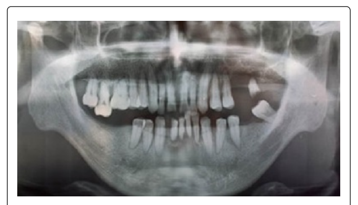
Figure 2: Panoramic x-ray; Generalized severe bone loss.

1. Complete blood count, hemostasis test, and glucose (Values in normal parameters).