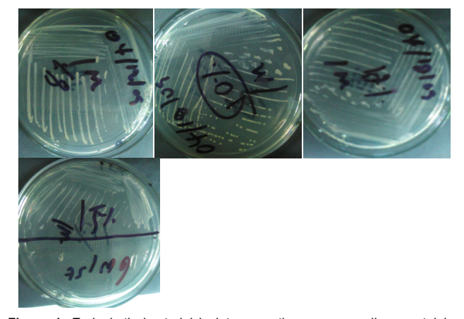
Figure 1: Endophytic bacterial isolates growth on agar medium containing different salt concentration.

Screening of bacterial endophytes for a biotic stress tolerance: The isolated tef seed endophytic bacteria were characterized for optimal growth temperature, salt tolerance, lytic enzymes secretion capacity, seeds germination and plant growth properties.