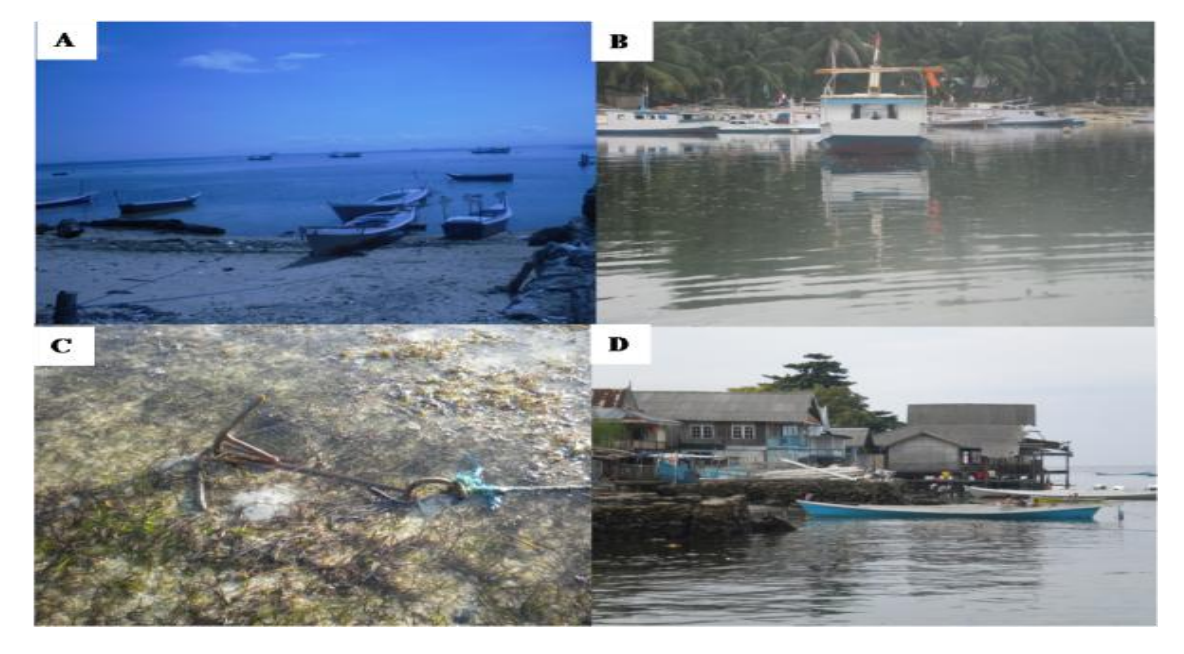
Fig. 2. Common boating activities in Indonesia. (A,B) Parking boats in seagrass beds, (C) anchoring in the seagrass beds as a part of boat parking, (D) boats as the only transportation facility for the local coastal communities.

2004). The seagrass can make self-recovery and regrow in propeller scars, however it takes time and species dependent (Dawes et al. , 1997).