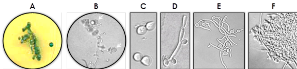
Figure 1: Candida albicans cells visualized under distinct methods. (A) Colonial morphology of C. albicans grown in CHROM Agar Candida medium, showing the typical green color that corresponds to the presumptive identification of this fungal species. (B) Spherical chlamydospores (arrows), mostly terminal, often on a slightly swollen subtending cell are formed near the edge of the cover slip. (C-F) Different morphological growth forms of C. albicans . (C) yeasts, (D) pseudohyphae, (E) germ-tube and (F) hyphae.

patients, being the commonest human fungal infection reported in clinical settings around the globe [1-9]. Yeast-like microorganisms belonging to the Candida genus are the etiological agents of candidiasis, which are common dwellers of the oral cavity, gastrointestinal tract and vagina of normal people. However, when the conditions become appropriate, the nonpathogenic yeast forms are transformed into pathogenic invasive forms [1-9] (Figure 1).