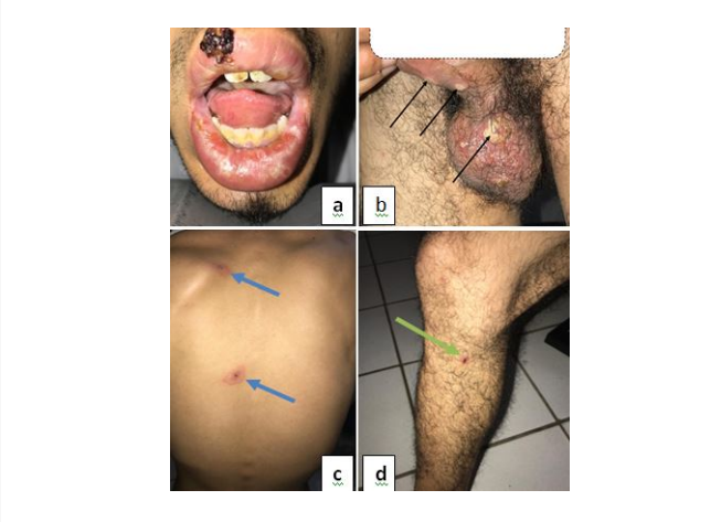
Figure 2: Extra ocular sign of Behcet's disease with atypical Granulomatous Uveitis in 37-year-old patient.

From a therapeutic point of view, all patients underwent fulldose corticosteroid therapy. An immunosuppressant type cyclophosphamide by bolus was introduced in 9 patients, with a relay initiated in 8 patients by azathioprine. One of these patients was in addition treated with biotherapy (anti-TNF) due to severe ocular involvement. The average duration of follow-up was three years. A good response was noted in 64.4% (Figure 2).