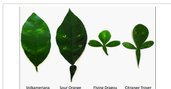
Figure 1: Leaves showing different intensity of symptoms according to their susceptibility to Mal Secco, 30 days post inoculation.