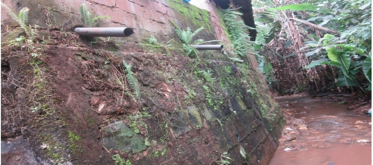
Figure 2.0. Pipes projecting from a toilet into a nearby stream in New layout Nkwen . Picture by Polycarp Ndikvu July 2015 (Figure 2) and thick film, of stool settles after the rains (figure 3).

streams but the others from Up-station reach the foothill zone through a series of small waterfalls over bare hill slopes which, together with the hills, form the most striking feature of the Bamenda urban area. Since the streams are youthful, flow is rapid. Thus, debris and watershed runoff from the slope sub-system become part of the input of the stream channels. During the rainy season, the linear-dendritic streaming system (Figure 1), combined with various erosional processes such as river valleys, causes spillage, subjecting houses and properties, particularly those along stream courses, to periodic flooding during torrential rainstorms. It is during this rainstorm that some inhabitants near the streams open their toilets to discharge faeces into the streams.