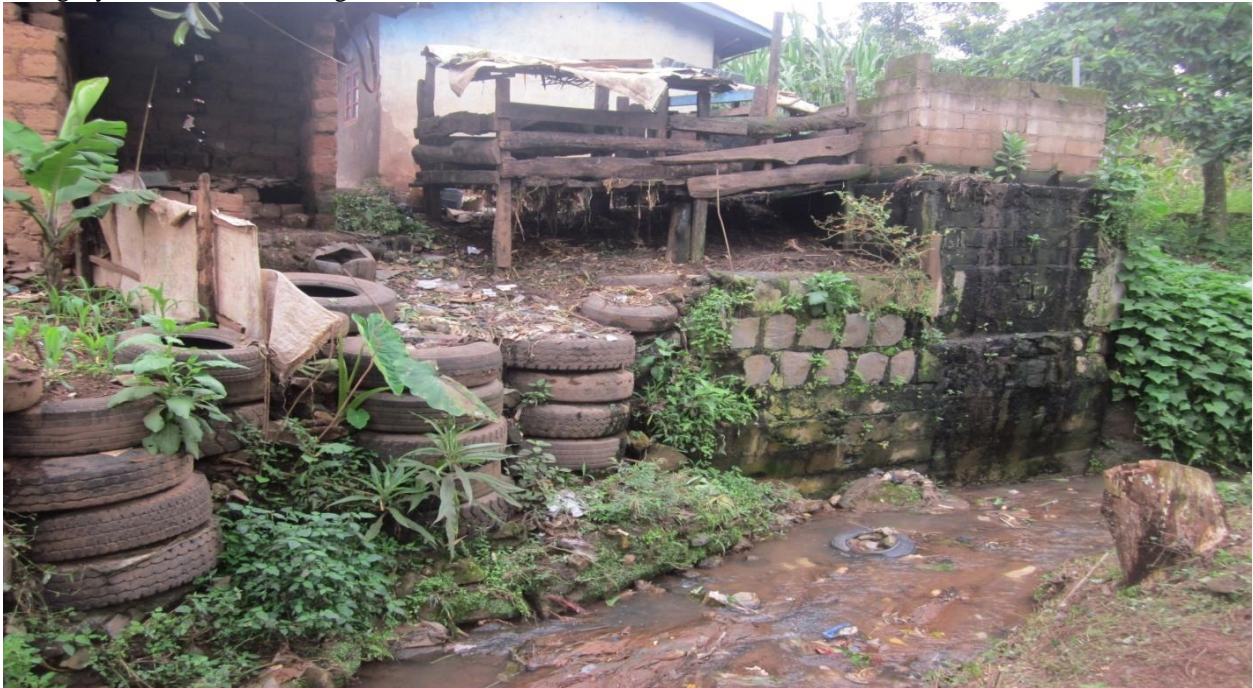
Figure 4. Pigsty the along New Layout stream. July 2015

Pig styles are also built along the stream banks and when rains fall the faeces are washed into the stream water.