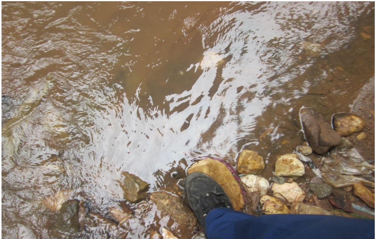
Figure 3.0. Film on the water below the pipes projecting from the toilet into the stream in New layout Nkwen. Picture by Polycarp Ndikvu, July 2015