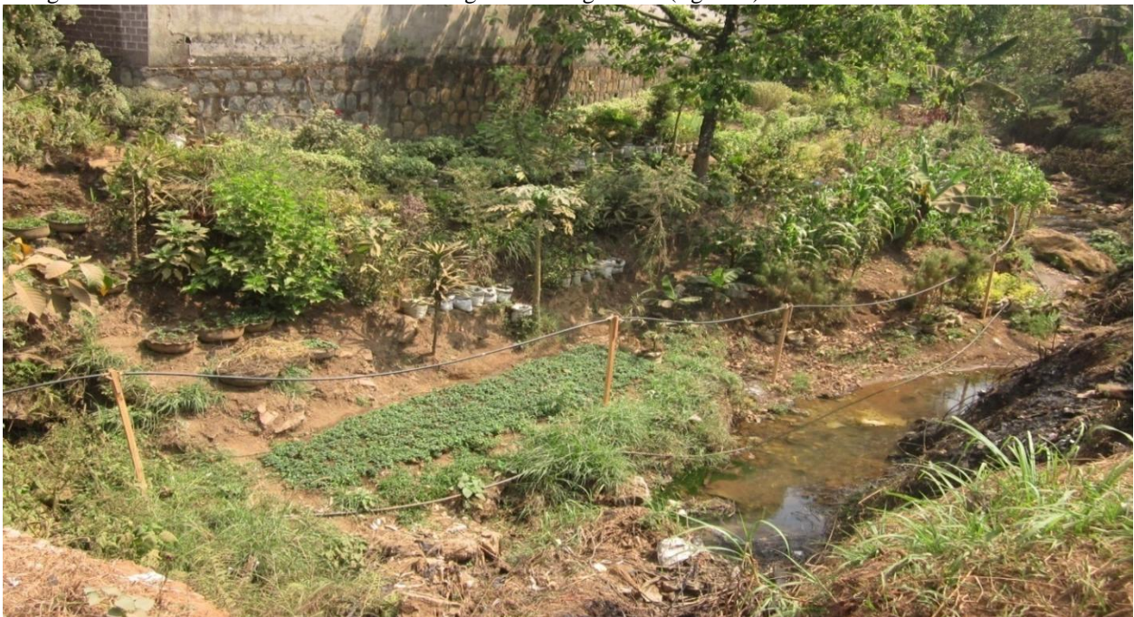
Garden along the Ayaba stream, Picture by Polycarp Ndikvu July 2015

Some gardeners use the water down stream to irrigate their vegetables (figure 5)