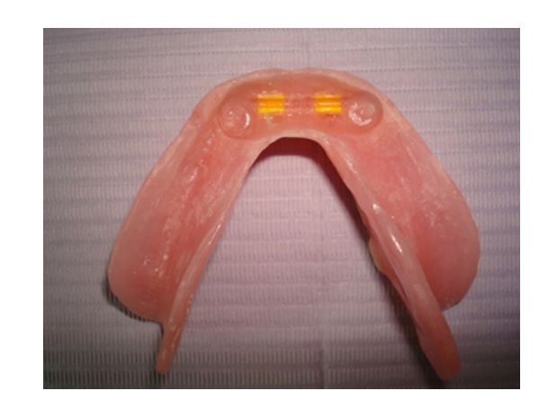
Figure 4: Fitting surface of mandibular overdenture retained by Bar-clip attachment.