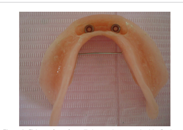
Figure 3: Fitting surface of mandibular overdenture retained by Bar-locator attachment.

According to Schimmel et al. [13] Two-color chewing gum test for masticatory efficiency was used to evaluate the masticatory efficiency (Figure 5). Samples of a two-color chewing gum were prepared. Strips of 30 mm length were cut from both colors and manually stuck together [13], so that the test strip presented were 30 \times 18 \times 3 mm. Patients were instructed to chew five samples of chewing gum for 5,10,20,30 and 50 chewing cycles. After chewing the gums, the samples were then spat into transparent plastic bags, which were labeled with corresponding numbers of strokes. All samples were assessed after flattening to 1 mm thick 'wafers'. The unmixed pixels counted using Adobe Photoshop