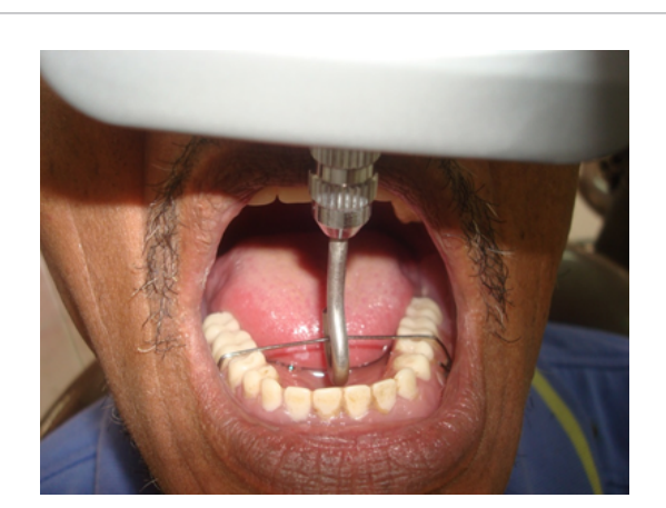
Figure 6: Clinical Retention Measurement.

Figure 5: Five chewed 2 color chewing gum at different numbers of strokes.