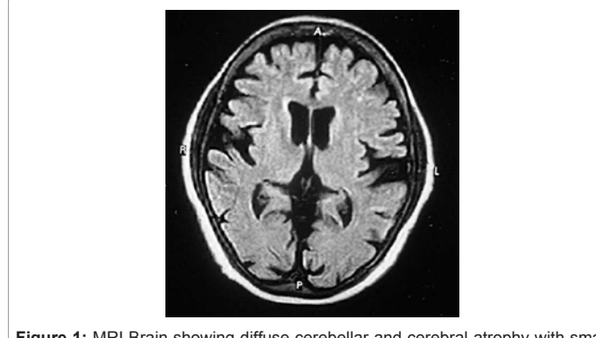
Figure 1: MRI Brain showing diffuse cerebellar and cerebral atrophy with small foci in frontal white matter.

and mild tortuosity of neck vessels suggestive of atherosclerotic changes. Positron emission tomography (PET) scan showed global hypometabolism in the brain. Bilateral parietal lobe showed moderately reduced FDG uptake and bilateral frontal and temporal showed mild reduction. Left thalamus and right basal ganglia showed moderate reduction and both cerebellum showed mild reduction (Figure 2A).