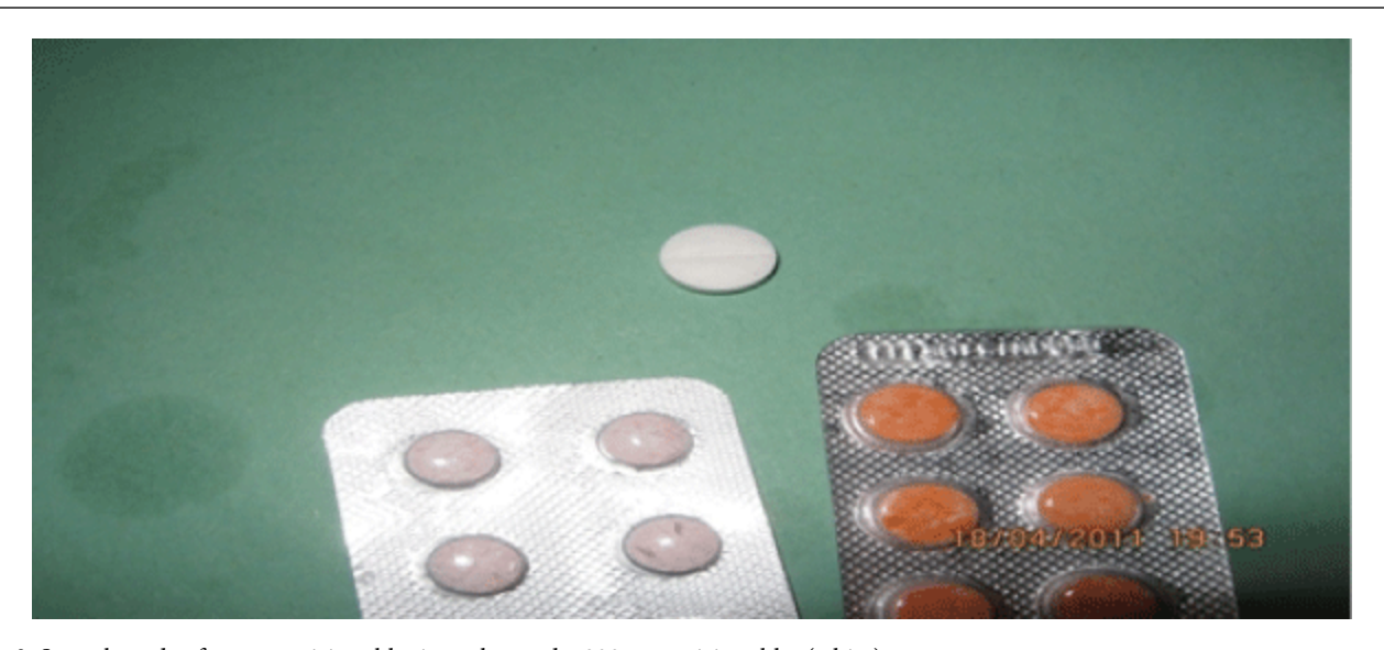
Figure 2: Some brands of 75mg aspirin tablet in sachet and a 300mg aspirin tablet (white)

In summary, this paper argues that the scientific/ethical grounds that can justify the almost universal use of aspirin in type 2 diabetes and/or hypertension especially as primary prevention for atherosclerotic disorders as recommended by local experts is yet to emerge. This calls for greater restriction of baby aspirin availability at all tiers of care with closer monitoring of its use to minimize misuse/ abuse. Moreover, making the 300 mg aspirin tablet formulation as available as the 75 mg tablet formulation could give prescribers and consumers greater choice in lowering treatment cost for individuals requiring low dose aspirin therapy especially for secondary prevention in those with known occlusive atherosclerotic disease, but are unable to pay the higher cost of using the 75 mg tablet formulation that comes with more convenient packaging (Figure 2).