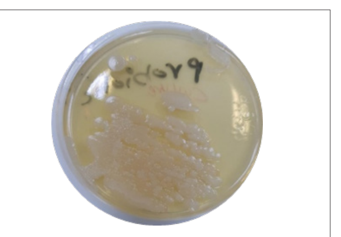
Figure 1A: Characteristic colonies of lactobacillus spp. on BHIA.

Probiotic lactobacilli were isolated from the commercial probiotic product "Vitalactic B" and identified by noticing their colony morphology (Figure 1A), and cultural as welcome biochemical characteristics. Microscopically they were Gram-positive (Figure 1B), rod rod-shaped-motile, and absence of Endospore.