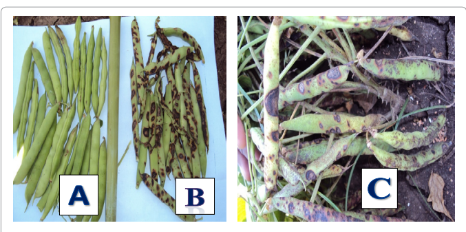
Figure 2: Infection of anthracnose on C) stand plant, B) collection of infected pods and A) collection of anthracnose free pods.