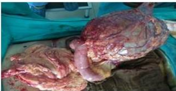
Figure 3: A large cystic mass adhered to mesentery and distal bowel.

The intra operative findings showed a large cystic mass adhered to the mesentery and the distal ileum around 2 feet proximal to the IC junction (Figure 3). The cyst was carefully dissected and excised without any evidence of spillage (Figure 4). The cyst was opened on the dissection table which drained around 400 ml of purulent fluid and an old surgical mop (Figure 5). The patient had an uneventful postoperative period and was discharged after 5 days in a good healthy general condition.