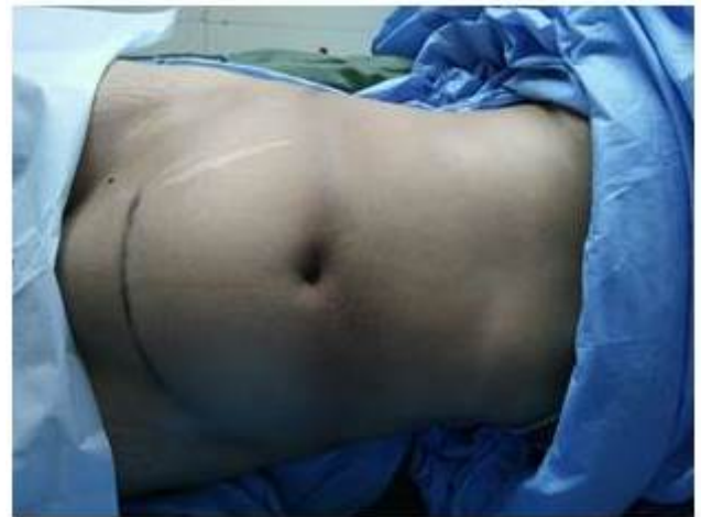
Figure 1: Prop View with previous pfannenstiel incision.

The patient was well built with no pallor and stable vitals. Abdominal examination showed a large lump in the lower abdomen involving the hypogastrium, inferior paraumbilical region and bilateral iliac fossa. The lump was cystic, non-tender, with restricted mobility and dull on percussion with no overlying band of resonance. A healthy pfannenstiel incision was noted over the lower edge of the lump. Rest of abdomen was normal (Figure 1).