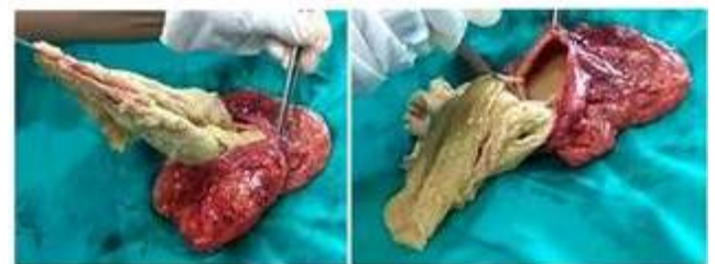
Figure 5: Old surgical mop with pus encased within the cystic mass.

Patients can present with nonspecific abdominal pain and intestinal obstruction, a palpable mass, nausea, vomiting, abdominal distension, and pain [5]. The symptoms depend upon the location, size of swab, and the type of reaction that occurs. Patients may rarely also present with fistula, perforation, or even extrusion per anus. Various imaging findings can help us to diagnose gossypiboma.