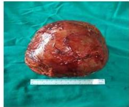
Figure 4: The cyst was carefully dissected and excised without any evidence of spillage.

They do not cause any specific reaction except adhesions and granuloma formation and hence may stay asymptomatic for a long time. An exudative reaction leads to the formation of an abscess and a fibrotic aseptic reaction forms a granuloma and hence a development of a mass [7]. Our case was a mixture of the two leading to an encysted collection around the surgical mop.