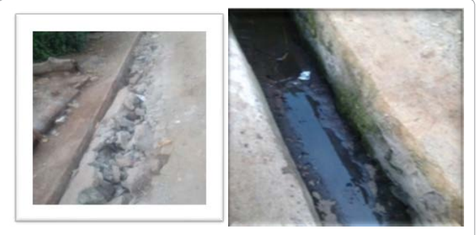
Figure 2: Sample drainages in the study area.

Table 1: Drainage types in the study area. Soddo Town Municipality, 2015 [7].