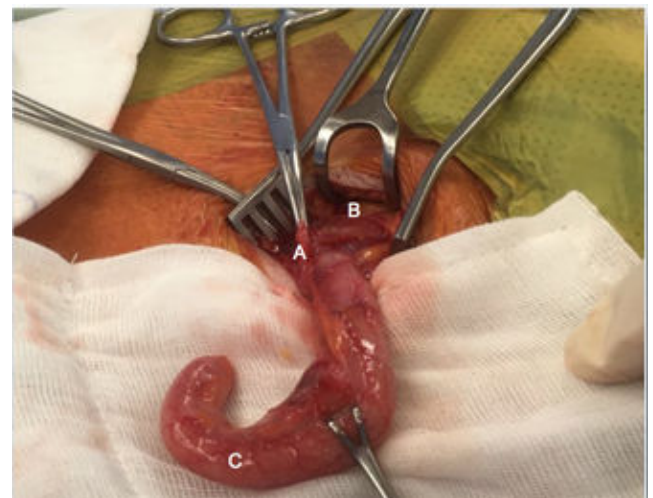
Figure 1: Indirect sac (A), Cord structures separated from the sac (B) and vermiform appendix (C).

The patient was discharged home on the following day and returned for routine post-operative follow-up six weeks later with no complications or recurrence. Histopathology of the appendix showed normal mucosa and muscular layers with some evidence of serosal granulation tissue and inflammation (Figure 2).