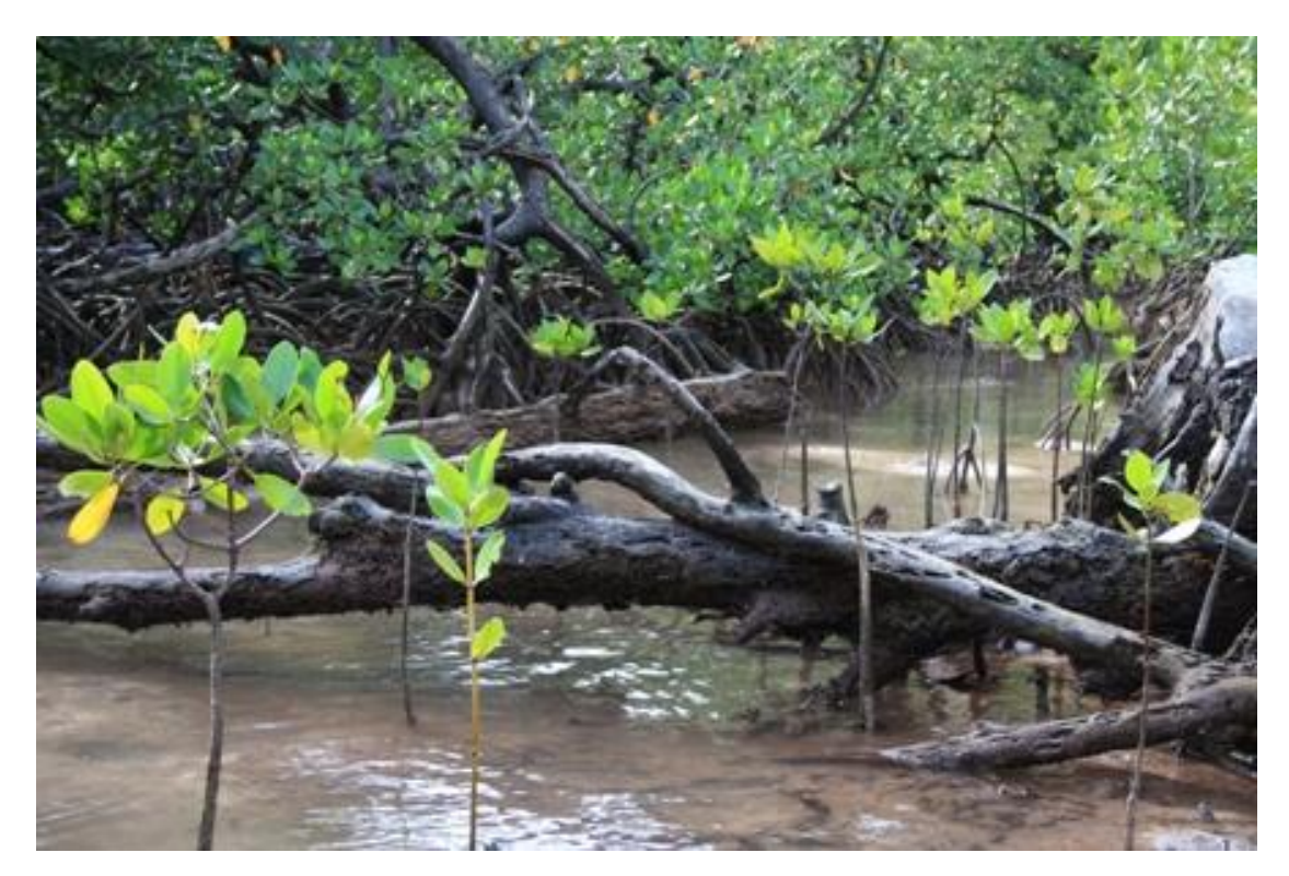
Fig. 1. Mangrove area that can be used for pond aquaculture.

As described above, there are several uses for the coastal marsh and mangrove areas. Both coastal marsh and mangrove areas are productive where higher plants grow on the mud and have greater use to man. They can control erosion and serve as buffer areas to prevent flood damage. Their ecosystems have been described as constituting a reservoir, feeding ground, refuge, nursery and spawning area for many animals such as crabs, shrimps, clams, mussels, oysters, fish and etc. Therefore, an alternative way to practice Recirculation Aquaculture Systems (RAS) may be fostered to reduce the impacts of coastal aquaculture to the environment. RAS are a relatively new