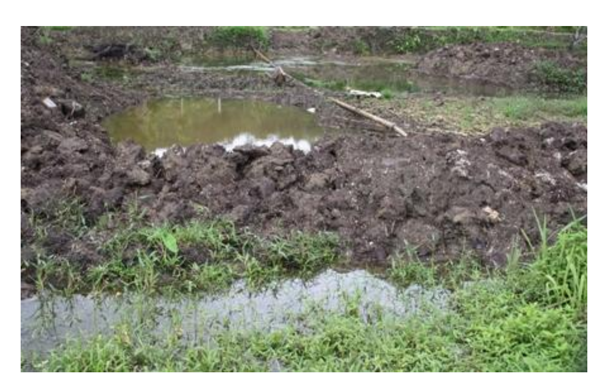
Fig. 3. Site selection for opening pond may cause destruction of coastal area.

The success of a commercial aquaculture business depends on providing the optimum environment for rapid growth. RAS offers the advantage over coastal pond aquaculture of being able to control the environment and water quality parameters to optimise fish health. Some parameters are crucial to RAS i.e., pH, temperature, suspended solids, and concentrations of nitrogenous compounds such as ammonia, nitrite, nitrate, dissolved oxygen (DO), carbon dioxide (CO<sub>2</sub>) and alkalinity (Timmons, et al., 2001). For instance, the optimum pH range for biofilter bacteria in RAS is around 7 to 8. The pH tends to decline as bacterial nitrification produces acids and consumes alkalinity and as CO2 is generated by microorganisms and cultured animals. Water reacts with CO<sub>2</sub> to form carbonic acid that resulted to the decreasing of pH value, so, nitrifying bacteria will not be able to remove wastes of toxic nitrogen. Therefore, adding alkaline buffers is needed to maintain the optimum pH range. Moreover, continuously supplying adequate amounts of DO is essential as nitrifying bacteria become inefficient at DO concentration below 2 ppm. Generally, DO have to be maintained above 5 ppm for optimum cultured animals growth (Losordo, 1998).