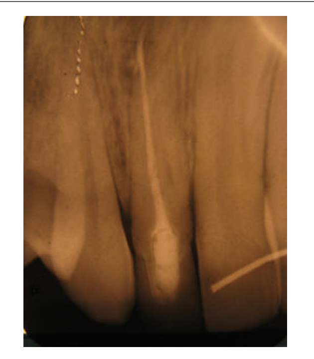
Figure 5. Periapical view after endodontic treatment.

Tooth bleaching was performed with 10% carbamide peroxide, with ambulatory guttering overnight for 15 days. The patient returned for control sessions once a week to evaluate the bleaching effects. She has been given some advice concerning the use of the gel, the cleaning of the gutter, the risks of sensitivity and the control of the diet in order to avoid highly staining foods, such as teas and coffee [14]. But the result of the bleaching was not satisfactory enough, the patient refused to correct the color of the two central incisors by veneers. Then, the patient was referred for restorative treatment, and an endodontic treatment of the 12 using a microscope was made ( Figure 5 ).