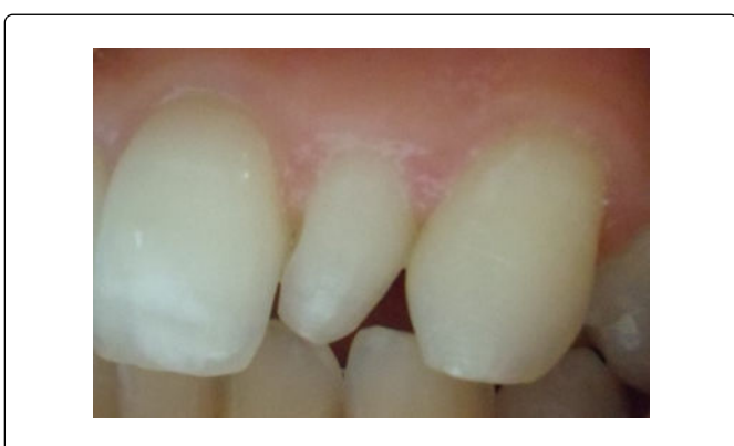
Figure 15. Lateral view of the 22.

However, the installation of an all-ceramic crown on the 12 is a more prudent choice seen that it was impaired by endodontic treatment. The decision to make a veneer on the 22 was declined since after preparation for veneer 3/4 the coronary volume was very minimal ( Figure 15 ) with a palato version important. An all-ceramic crown was chosen to increase the mechanical strength and preserve the tooth.