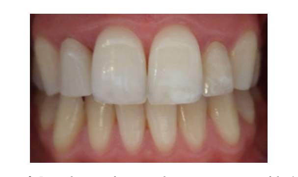
Figure 9. Reproduction of spots on the temporary crown of the 22.

For the color of the two crowns, the patient was put before two choices either to reproduce the white spots that appeared in the central incisors after orthodontic treatment or to choose only the base color. During the preparation of the temporary crowns, these spots were reproduced on the 22 and not on the 12 to facilitate the choice between these two options ( Figure 9), and finally she chose not to reproduce these white spots.