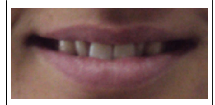
Figure 2. The initial smile.