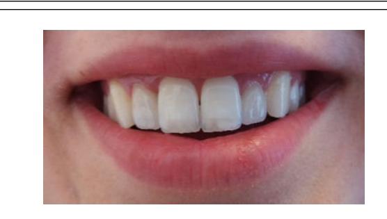
Figure 14. Aesthetic and biological integration of the final restoration.

Then working cast was performed ( Figure 10 ), and scanned, the crown was designed Depending on the color chosen, milled by CAD/CAM ( Figure 11 ), and checked intraorally to control the gingival margins adaptation, the restoration of contact point areas, gingival embrasure opening, static and dynamic occlusion especially the canine guidance, the occlusal scheme was identified using articulator paper.