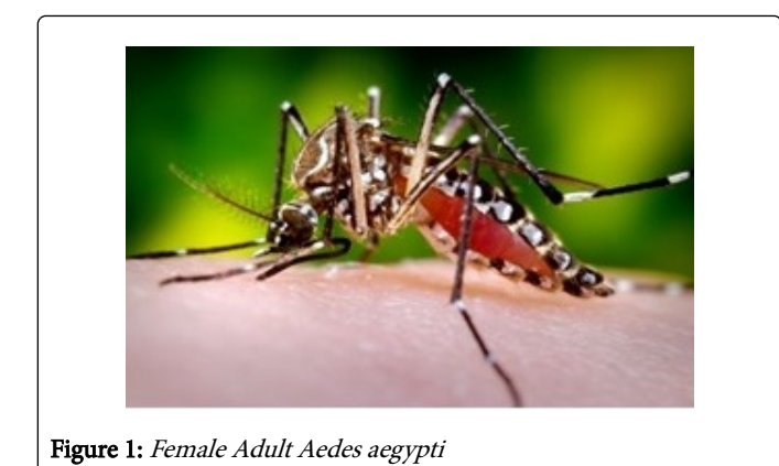
Adults Aedes aegypti has white scales on the dorsal surface of the thorax that form the shape of a violin or lyre as shown in Figure 1, while adult Aedes albopictus have a white stripe down the middle of the top of the thorax. The abdomen is generally dark brown to black, but also may possess white scales [12]. Females are larger than males, and can be distinguished by small palps tipped with silver or white scales. Males have plumose antennae, whereas females have sparse short hairs. When viewed under a microscope, male mouthparts are modified for nectar feeding while the female mouthparts are modified for blood feeding. The proboscis of both sexes and the tip of the abdomen come to a point, which is characteristic of all Aedes species [13,14].