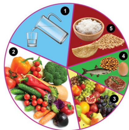
Figure 1: Flow chart showing dietary food intake.

Eat a balanced diet always; never eat to full stomach, high fiber vegetables should form the major portion of the food (Figure 1) [1]. High fiber vegetables are not a side dish, but make it a main dish. Take fruits daily, vegetables and fruits should be there each time, fill only half the capacity of stomach, never go for a refill when we eat-maximum three times a day only (Figure 2) [2].