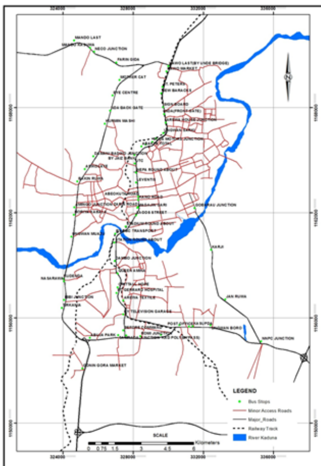
Figure 2: Kaduna Metropolis Showing Road Networks and Bus Stops

The routes considered for this study were the major roads within Kaduna metropolis as seen in (Figure 2). The bus counts data for the selected bus stops were used. According to the Kaduna State Traffic and Environmental Law Enforcement Agency bus stop enumeration exercise, 63 bus stops exist. A GPS was used to get the locations of each existing bus stop as seen in (Figure 2). The sample size for respondents to the questionnaire administered was 400. The number of respondents at each bus stop was achieved through stratification after purposively selecting 12 sample points with over 1000 buses counted at the bus stop per day.